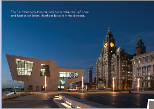
The Pier Head ferry terminal includes a restaurant, gift shop and Beatles exhibition. Beetham Tower is in the distance.