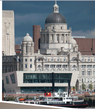
A view from across the Mersey of the Royal Iris ferry, the ferry terminal and the Port of Liverpool Building. St George's ventilation tower can be seen on the left.